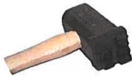
Regular Log Hammer