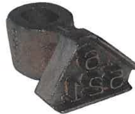
Lightweight Hammer, 3.25 lbs.